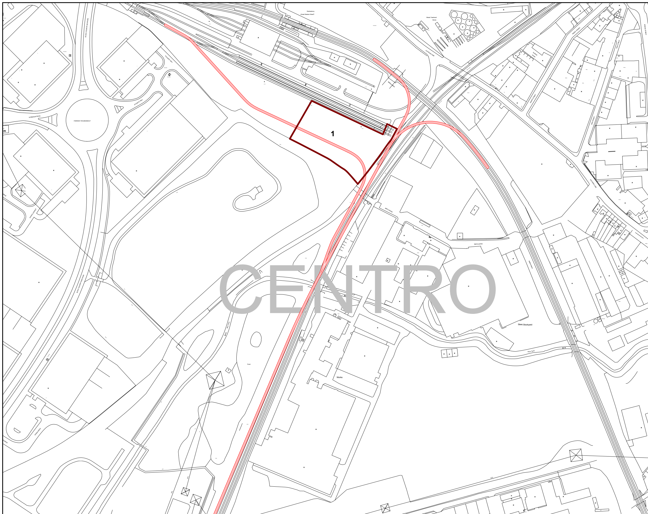
Figure 2.1 Route Alignment Map 1